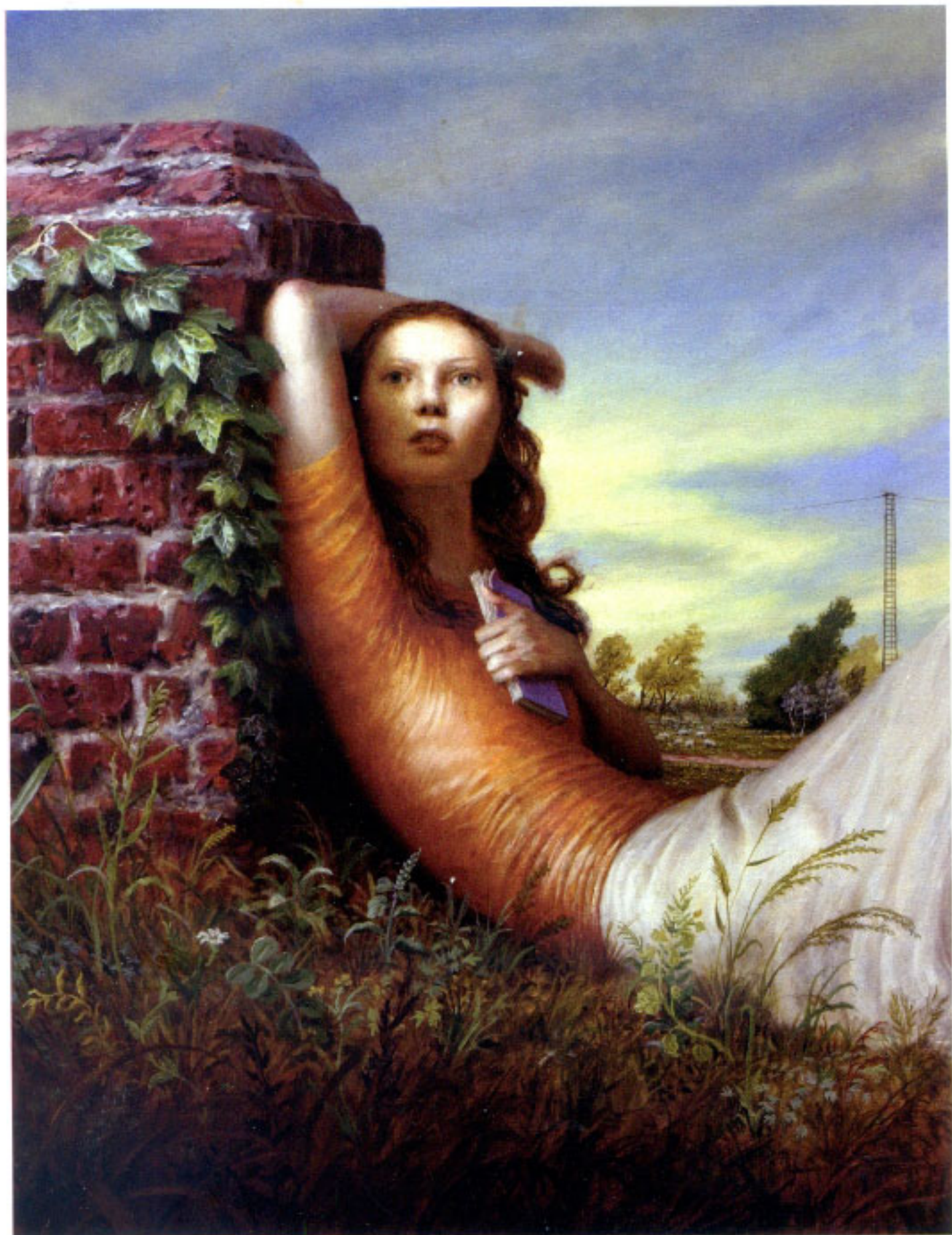
DROPOUT, OIL ON CANVAS, 51 X 24 \frac{1}{2} "