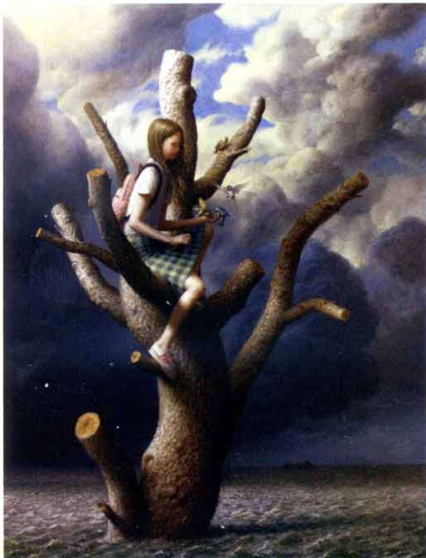
THE TREE, OIL ON CANVAS, 47 X 35"